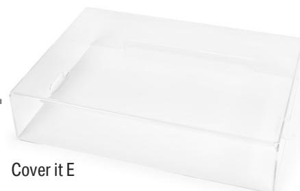
Cover it E