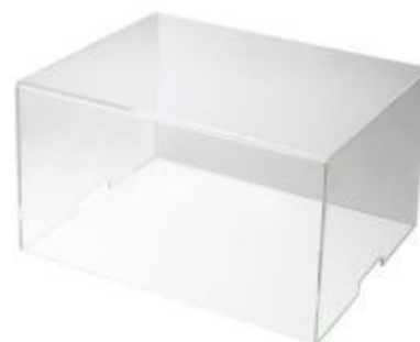
Cover it 1