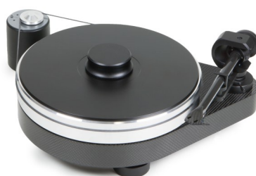
RPM 9 Carbon