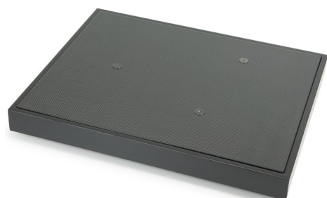
Ground it Carbon