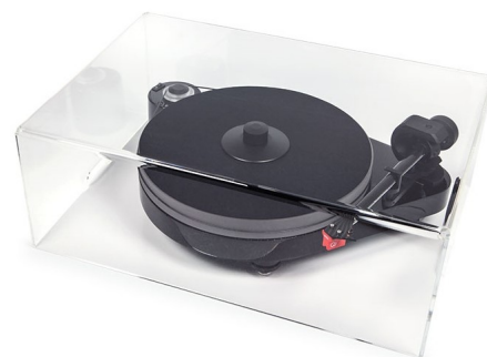
Cover it RPM 5/9