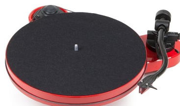
RPM 1 Carbon