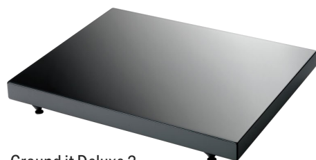
Ground it Deluxe 3