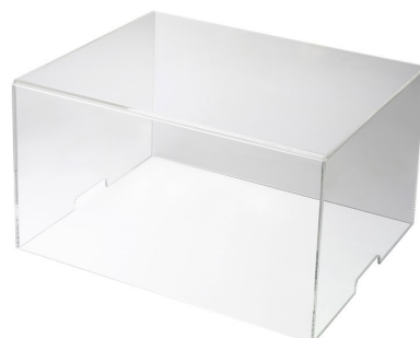
Cover it Signature 12

Ground it Carbon is supplied with RPM 10 Carbon