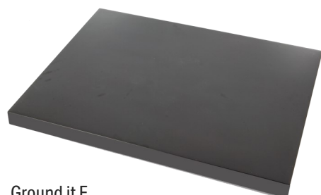
Ground it E