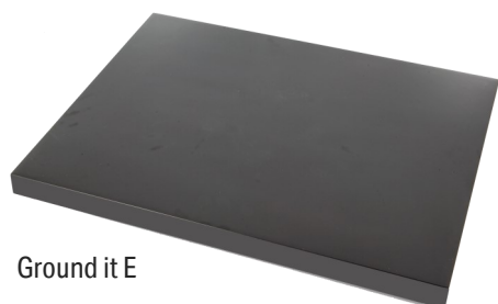
Ground it E