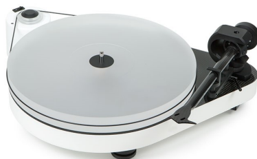
RPM 5 Carbon