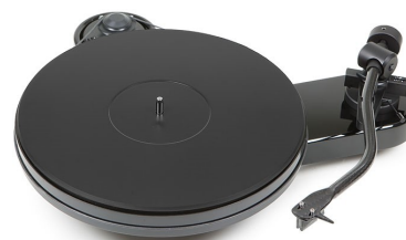
RPM 3 Carbon